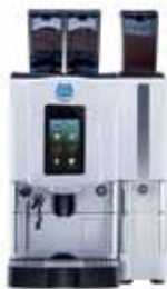
1 or 2 grinders Choco