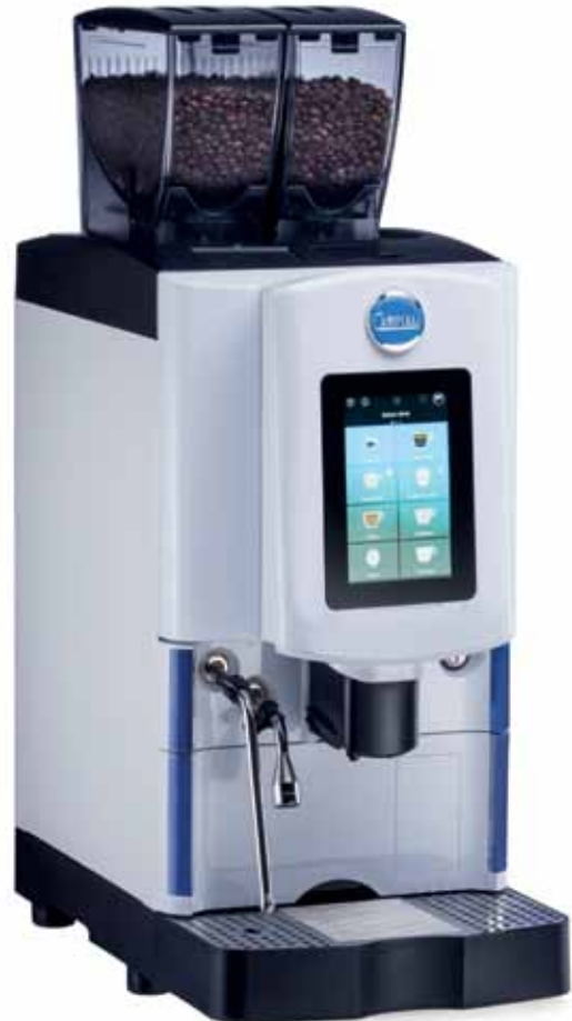
Optima Soft Plus