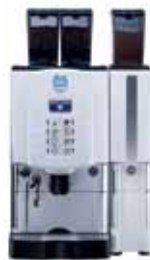
1 or 2 grinders Choco